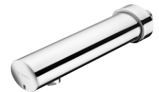
MODUS E wall outlet