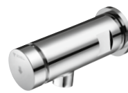
PETIT SC wall outlet